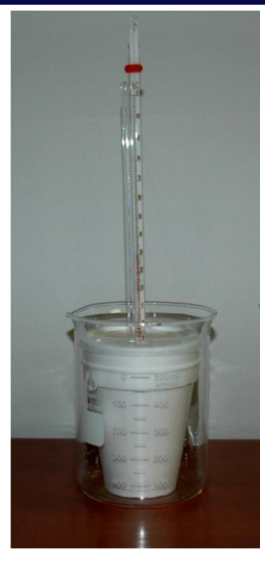
Figure 5. Sample set-up for Step 5.