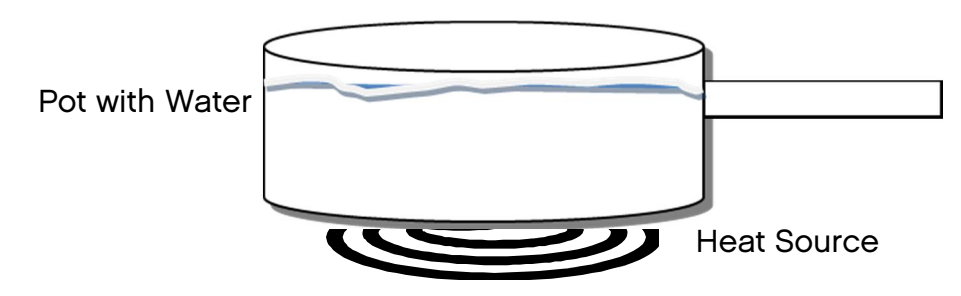
Figure 4. Sample set-up for Step 1. A pot with 500 mL of water rests on a stove top burner.

<u>Note</u>: If you do not have a stove, heat the 500 mL of water to boiling in a microwave safe container. To avoid the risk of superheating water (water that does not look boiling, but explodes when agitated), place a microwave safe object, such as a wooden toothpick, in the water and heat the water at 1 minute increments. At the end of every minute, tap the microwave-safe container before removing the container from the microwave to test if your water is superheated. Superheated water can be extremely dangerous and can result in hospitalization. Use extreme caution if using the microwave method to boil water. Once boiling, carefully remove the container using the provided hot pad.