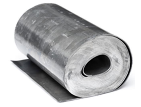
Figure 2: An unknown type of metal will be provided for you to perform your first calorimetry experiment.