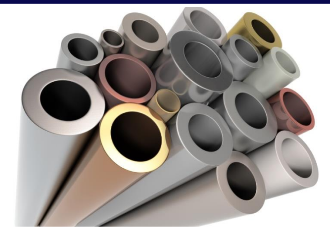
Figure 3: Heated metals will lose heat when put in a calorimeter. The lost heat is primarily absorbed (gained) by the water, while a small amount may also be absorbed by the calorimeter.