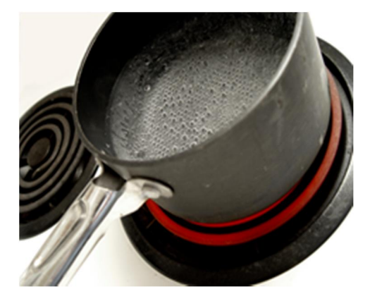
Figure 1: Water has a high specific heat capacity, so it requires more thermal energy to raise its temperature.

Every substance has the ability to absorb heat. If enough heat is absorbed, the temperature of that substance will rise. The amount of heat required to raise the temperature varies by the type and amount of a substance because of the different chemical and physical properties that exist. Specific heat capacity is the amount of heat per unit mass required to raise the temperature of a substance by one degree Kelvin (Figure 1).