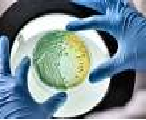
Figure 5: Different colonies can be distinguished by color and/or growth amount. Note, your colonies will vary in color and growth from the picture above.

yellow in acidic conditions. Fermentation of mannitol generates an organic acid which lowers the pH of the agar and changes the dye from red to yellow.