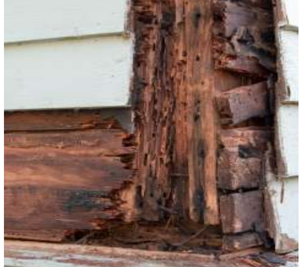
Figure 3: A wooden house frame damaged by termites. Termites harbor cellulose degrading bacteria in their digestive systems that allows the termites to use wood cellulose as an energy source. Cellulose comprises approximately 50% of the total biomass of wood.

Although these different media make bacterial identification the termites to use wood cellulose as an enand investigation much easier, there are still many obstacles ergy source. Cellulose comprises approxi-