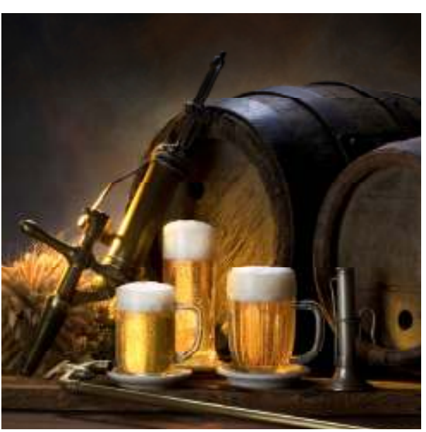
Figure 1: Wort, used to make beer, is considered a growth medium. It contains required nutrients for yeast to both survive and pro-(called fermentation). When fermentation is complete, the media and dormant microbes

Nitrogen, sulfur, and phosphorus are three additional elements that are required for survival and growth of bacteria. A duce alcohol under anaerobic conditions variety of salts and amino acids are added to media to provide these essential elements. Nitrogen and sulfur are re- can be consumed as beer.